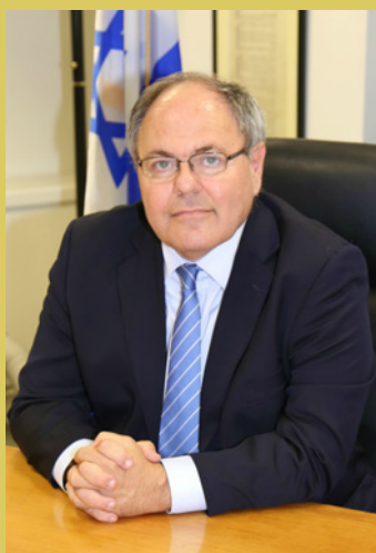
Ambassador Dani Dayan